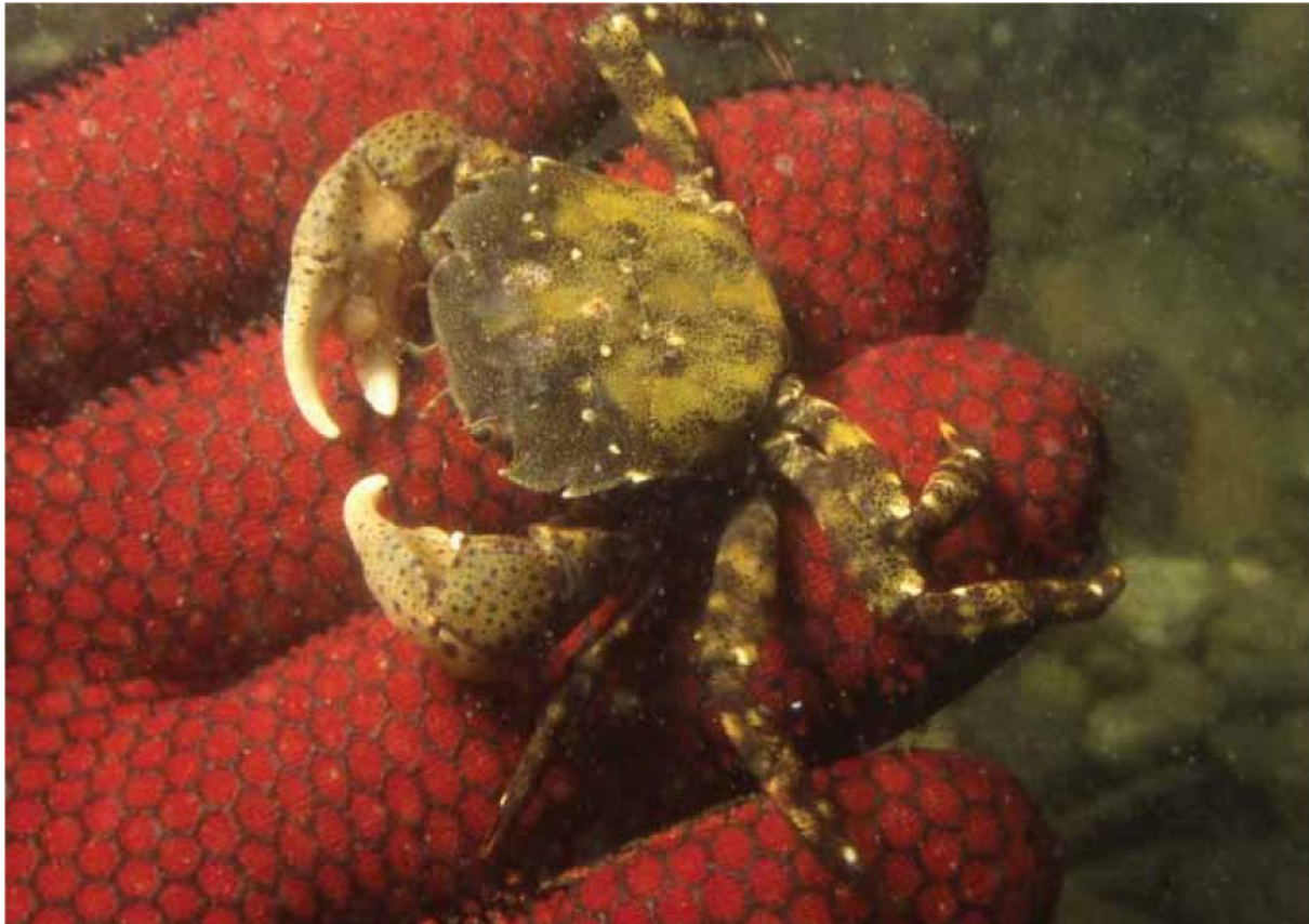
Photo 1 Live specimen of Asian shore crab underwater

If you think you have found a marine pest species notify your regulatory agency (see the Marine Pests website for contact details), so that it can be formally identified, monitored and potentially eradicated. Signs of a suspected pest could include unusually heavy biofouling, dominance of the biofouling by one species, or a 'new' species not seen before in your region. If possible, collect some specimens and keep them in a sealed plastic bag in the freezer until they can be taken for identification.