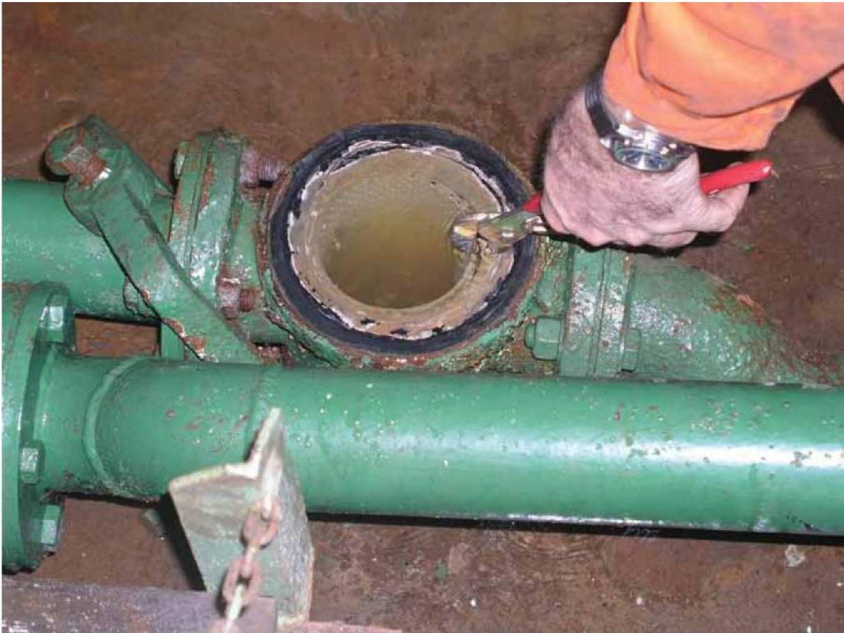
Photo 6 Internal sweater system being checked for biofouling growth

If seawater systems become fouled they should be treated with a product to kill all biofouling.