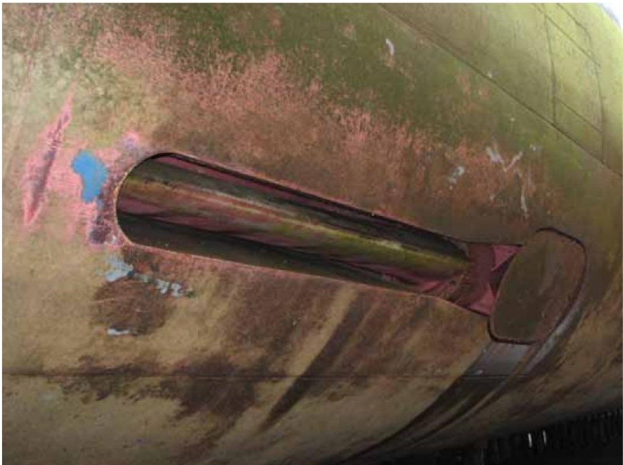
Photo 5 Retracted fin stabiliser with evidence of primary biofouling

Rudders should be moved port and starboard during the painting process to ensure that all surfaces are correctly painted to the correct specification of the antifouling system.