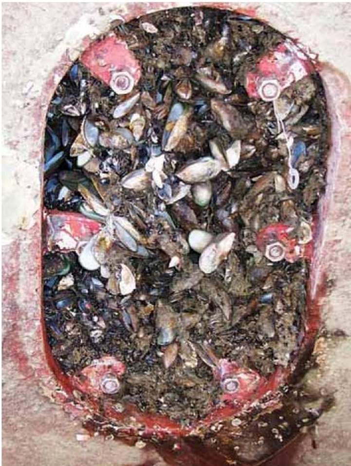
Photo 3 Sea chest with grate removed to show significant levels of biofouling

Note: This presents a risk not only for the effective operation of the vessel's motor but is also an effective niche area in translocating marine pests.